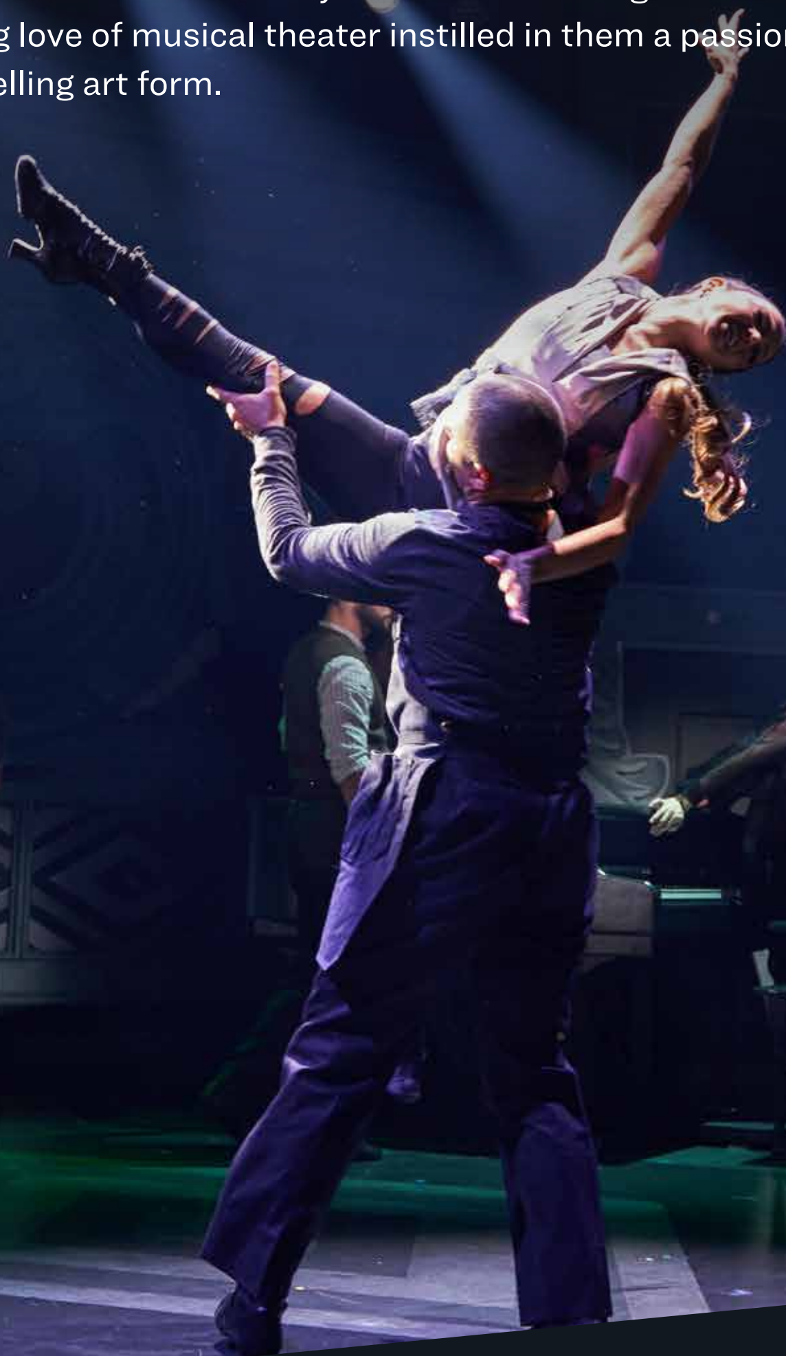
the CAST of ONLY GOLD