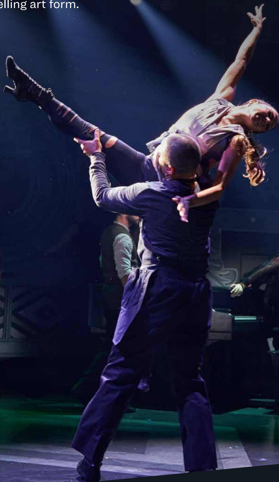
the CAST of ONLY GOLD