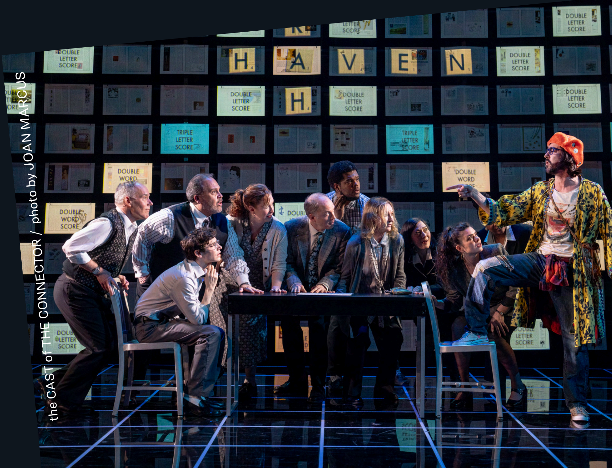
the CAST of THE CONNECTOR