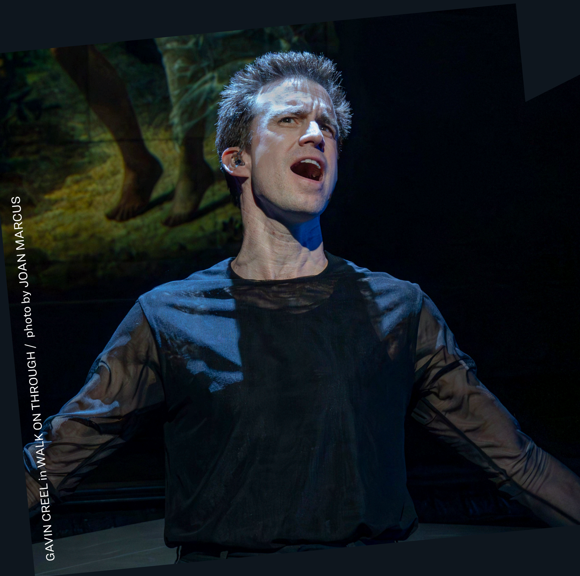
GAVIN CREEL in WALK ON THROUGH