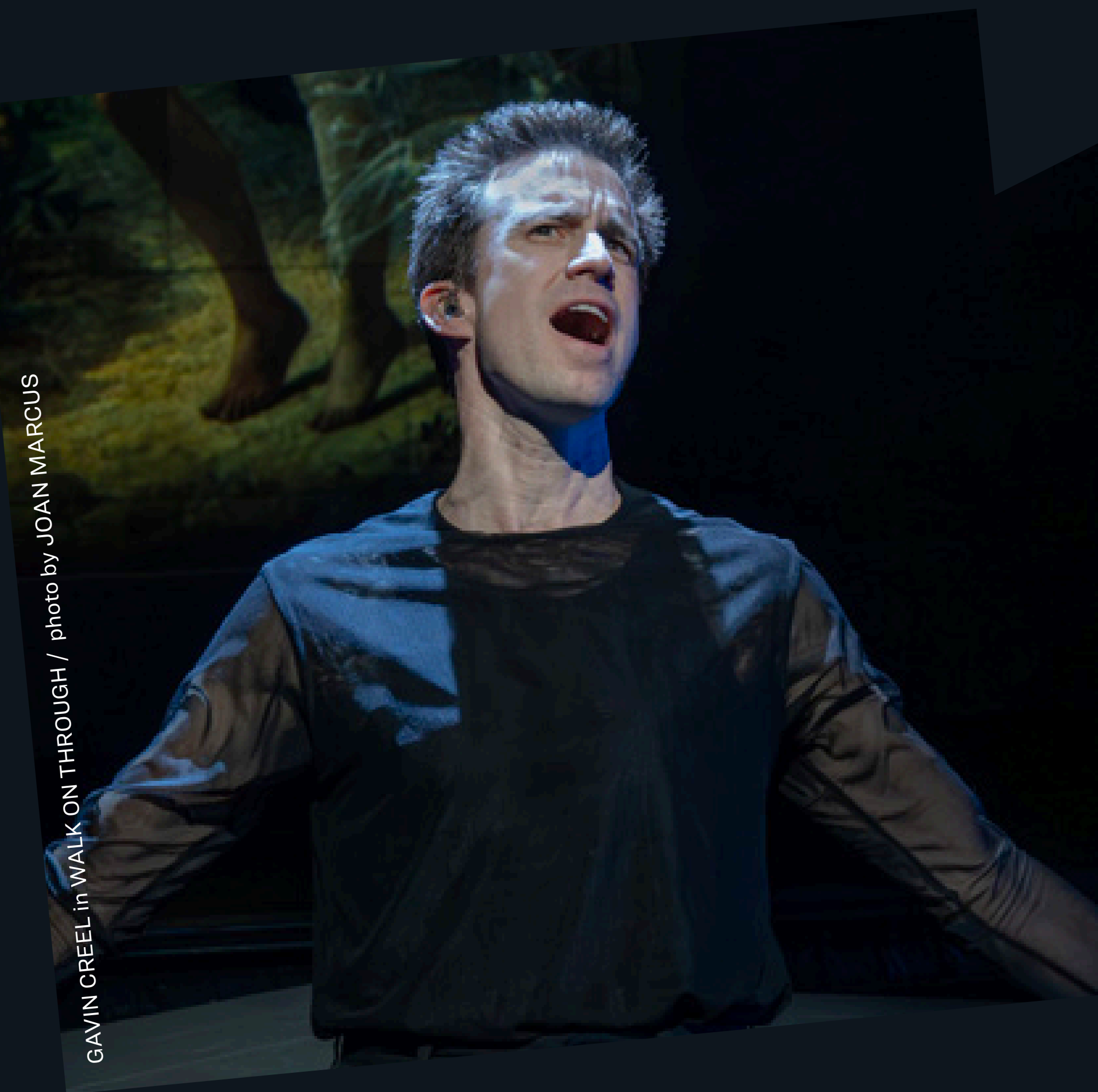
GAVIN CREEL in WALK ON THROUGH